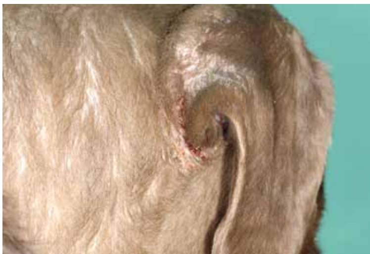
A mast cell tumor near the base of a dog's ear.

Mast cell tumors are relatively easy to diagnose with a test called fine-needle aspiration . Your veterinarian will insert a small needle into the tumor, extract some sample cells, deposit the cells on a glass slide, and then look at the cells under the microscope ( see bottom photo ). The test is quick, noninvasive, and inexpensive.